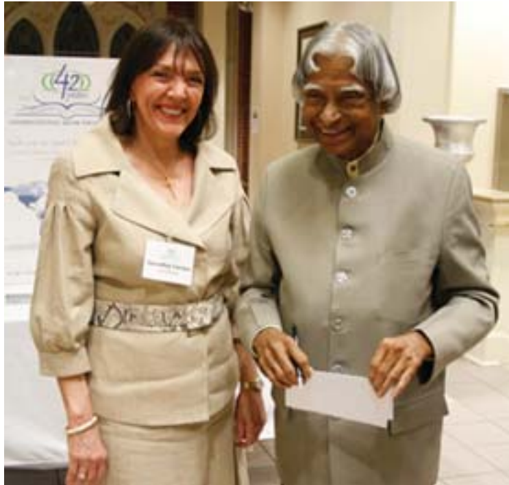
IBP Board President welcomes former President of India His Excellency Dr. Abdul Kalam to IBP's Spring Banquet.

Former President of India, Dr. A.P.J. Kalam delivered a speech to more than 200 guests at IBP's Spring Banquet at Christ's Church Cathedral in Lexington, Kentucky on Wednesday, April 7.