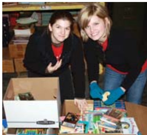
Volunteers from Target pack a Balikbayan box for an elementary school in the Philippines.