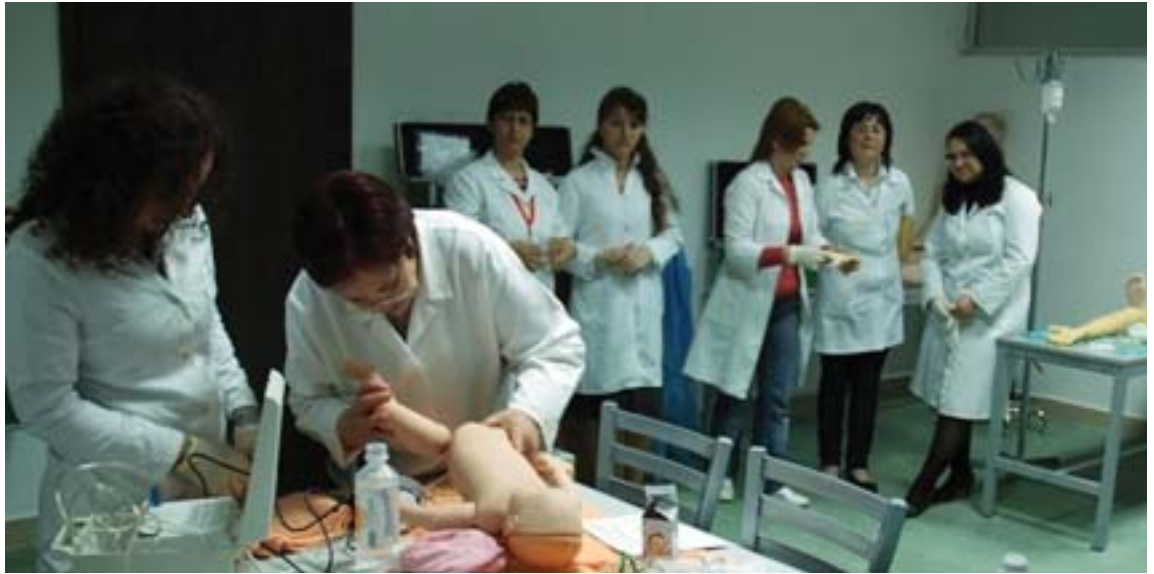
Nursing students at the American University of Tirana (AUT) practice pediatric care. AUT has traditionally trained medical professionals, but is expanding to teach a broader liberal arts curriculum.