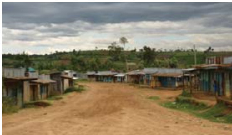
Tengecha Village in Kenya will receive a small community library of 1,000 books from IBP this summer. IBP still needs $1,500 in funding to complete the project.

Second, the need for books always exceeds the funds available for shipping. Please consider contributing financially to help IBP send books to our overseas partners.